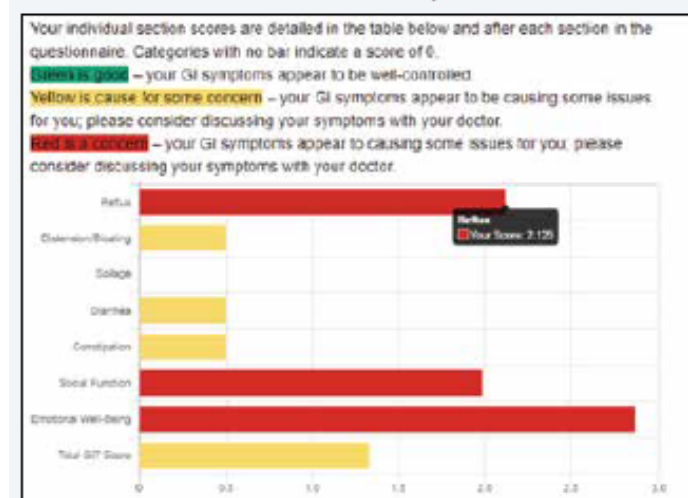
Figure 3: GI Questionnaire The UCLA SCTC GIT 2.0 Questionnaire

improvement or change in his/ her symptoms by completing the questionnaire at regular intervals. A red bar should also alert the person to notify their physician of worsening symptoms.